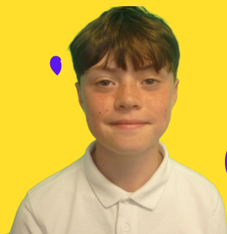
STANLEY - 'BE YOURSELF AND YOU WILL ACHIEVE'