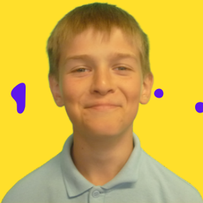
OWEN - 'THERE IS ALWAYS AN ANSWER TO YOUR PROBLEMS'