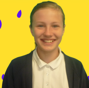
EMILIA - 'IF YOU BELIEVE IN YOURSELF YOU CAN ACHIEVE ANY GOAL'