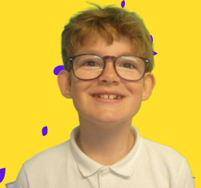
HEIDI - 'WHEN YOU FALL THERE IS ALWAYS CHANCE TO GET BACK UP'