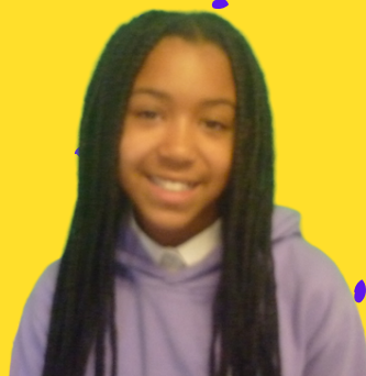
FARISA - 'BE THE BEST YOU CAN BE'