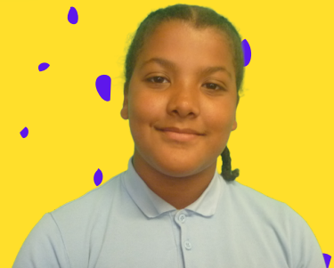
GG - 'THERE IS ALWAYS ROOM FOR THE TRUTH'