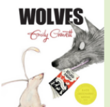
Wolves Emily Gravett